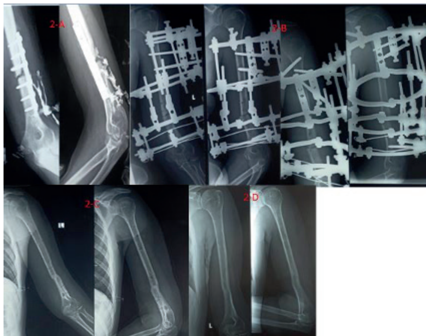
Fig. 2. — X-rays showing : A: pre-operative X-rays of infected non united fracture mid-shaft humerus fixed with a plate and screws. B : X-rays-after removal of internal fixation, sequestrectomy and Ilizarov application with acute compression. C & D : follow-up X-rays after Ilizarov removal.

and analgesics were administered during the hospital stay. The patient was discharged with oral antibiotics, according to cultures and sensitivity tests, oral non steroidal anti inflammatory drugs, anti oedema drugs like alpha chemotrypsin and neurotonics for two weeks.